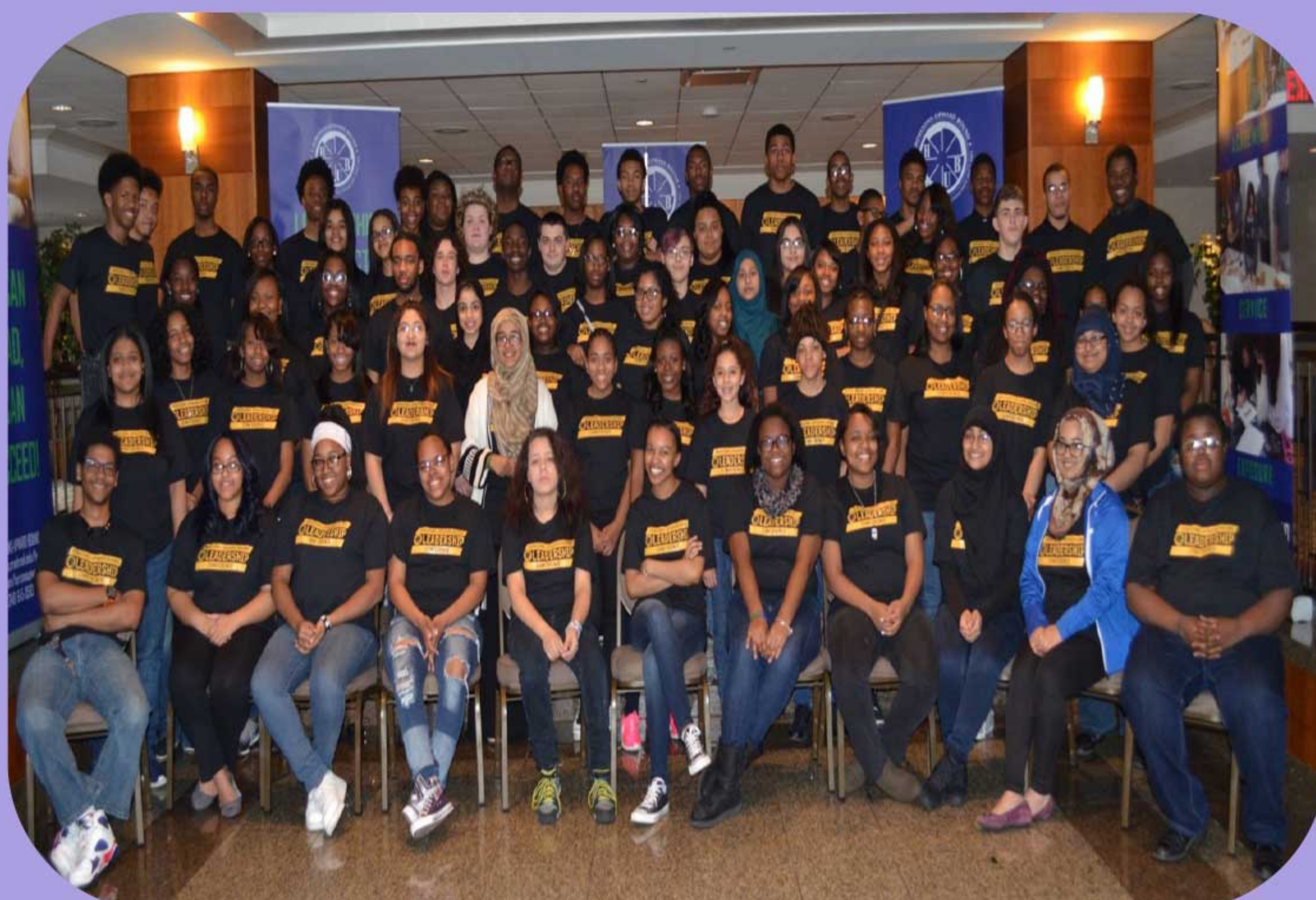
Participants for the first annual Horizons-Upward Bound Student Leadership Conference at Kingsley Inn, MI, on March 25 & 26, 2017