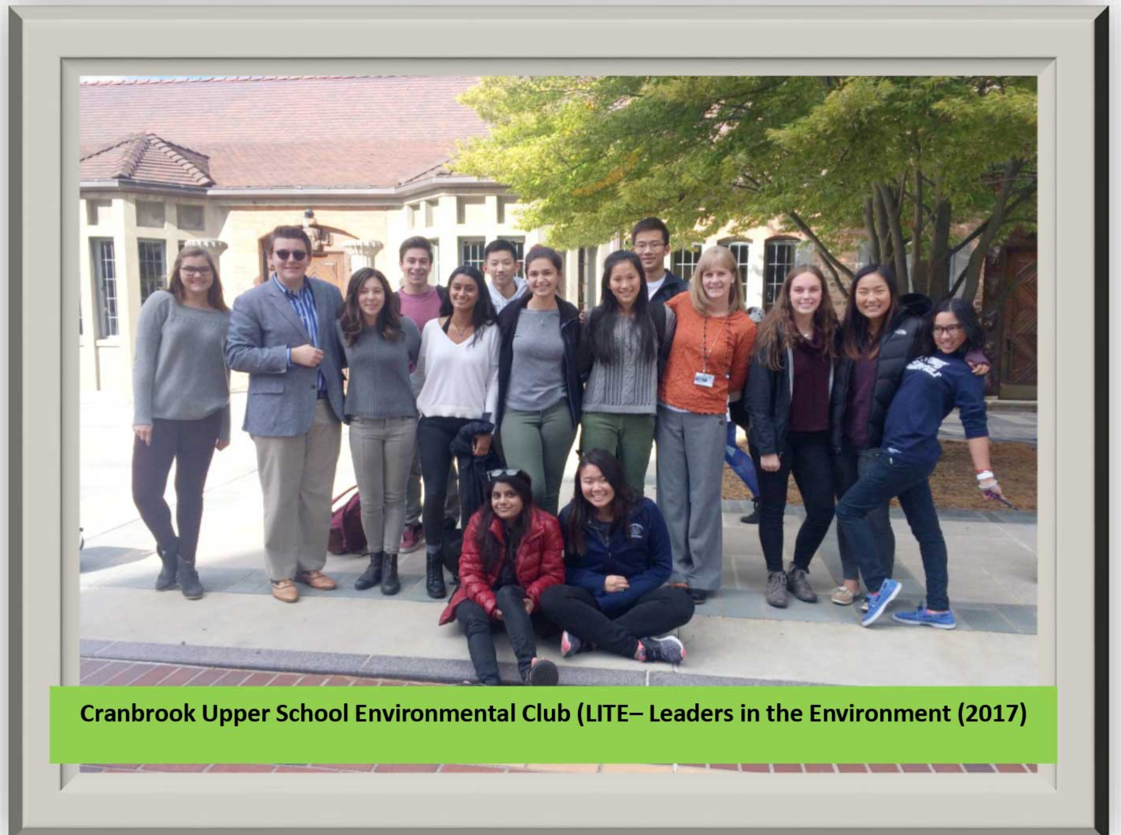
Cranbrook Upper School Environmental Club (LITE– Leaders in the Environment (2017))

Additional information regarding the Michigan Green Schools Award can be found at: http://www.michiganschools.us/