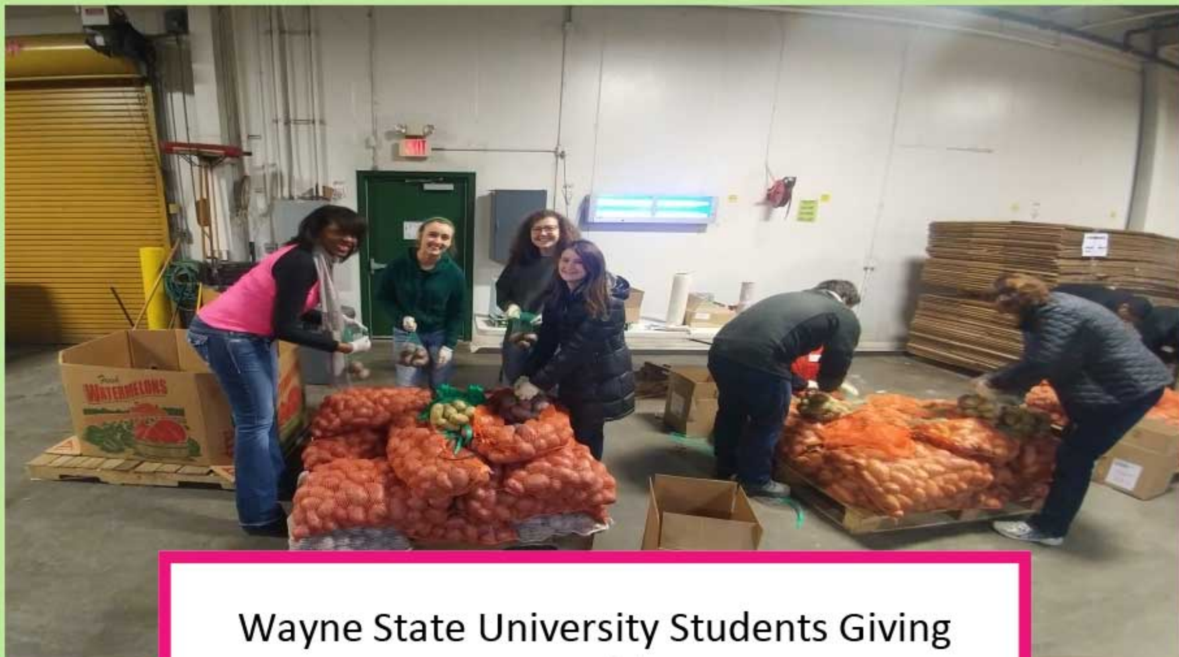
Wayne State University Students Giving Back!