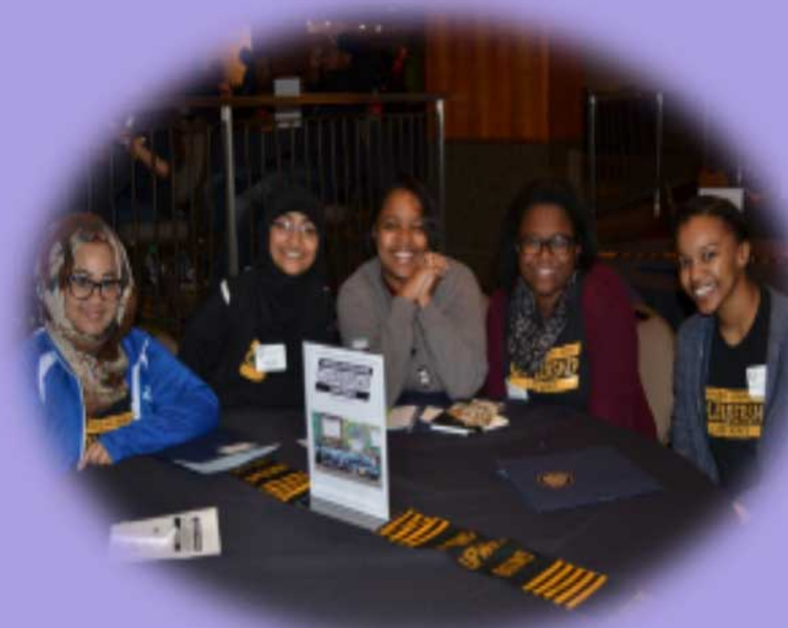
HUB students posing during conference